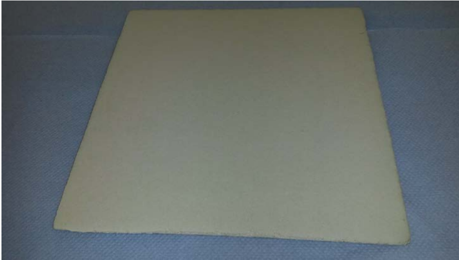
Photo of test specimen